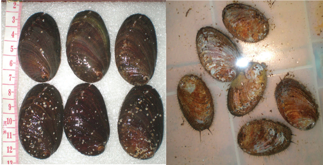
Figure 2. The Haliotis diversicolor supertexta (abalone), a important indigenous marine species in China.

to respond to adverse toxicant effects. However, several authors imply that this definition has certain limitations, because adverse effects may be influenced by a number of factors, including habitat utilization in the environment, feeding behavior, metabolism, and physiology. Larsson indicates that when we find effects on the molecular level in marine organisms exposed to chemicals, or in organisms sampled in contaminated environment, we should interpret this as a warning flag, not as evidence of an adverse effect (29). Furthermore, Thomas also points out biomarkers should act as ‘signposts’ not ‘traffic lights’ (47). In our opinion, for general bio-monitoring, one may want to assess exposure and interpret positive results as a warning flag or signpost. However, if one wants to try to assess whether cleanup efforts within a given ecosystem were effective, one might want “biomarkers of exposure” and “biomarkers of effects.” “Biomarkers of effects” are more robust than “biomarkers of exposure”, especially with exposure to complex mixtures. Of course, we have to wait and see if ‘markers of effect’ or ‘markers of exposure’ derived from different systems biology approaches are more robust when we move out in the field. Maybe, there would be use for both.